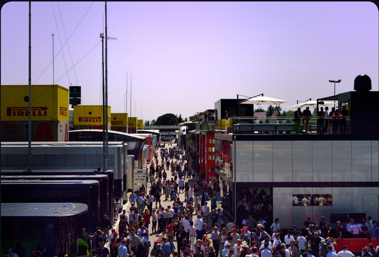
Opportunity to visit the F1 Paddock