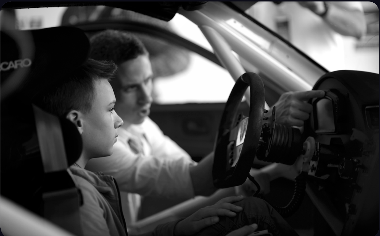
VIP access to the Support Race Paddock