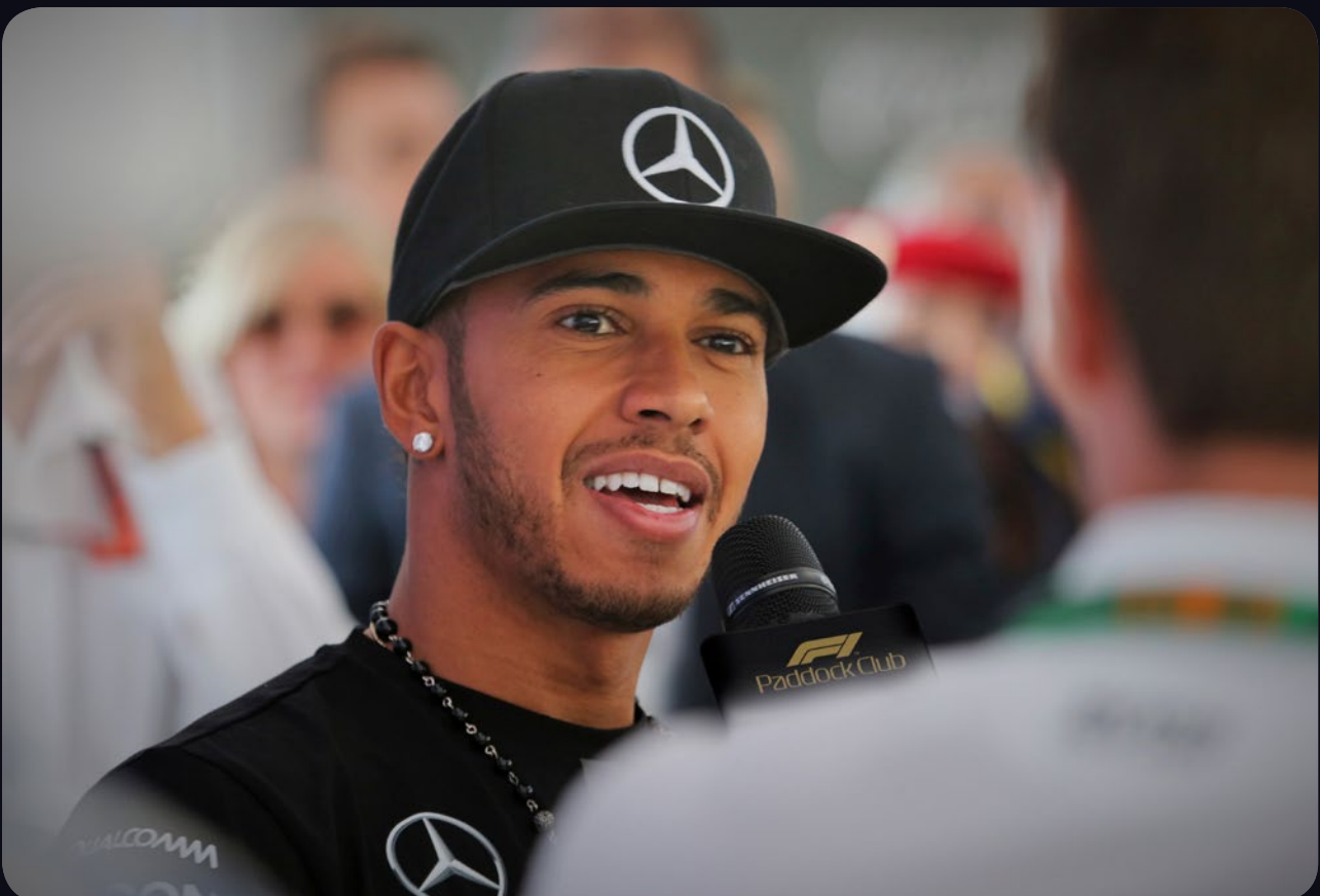
Entertainment and driver appearances