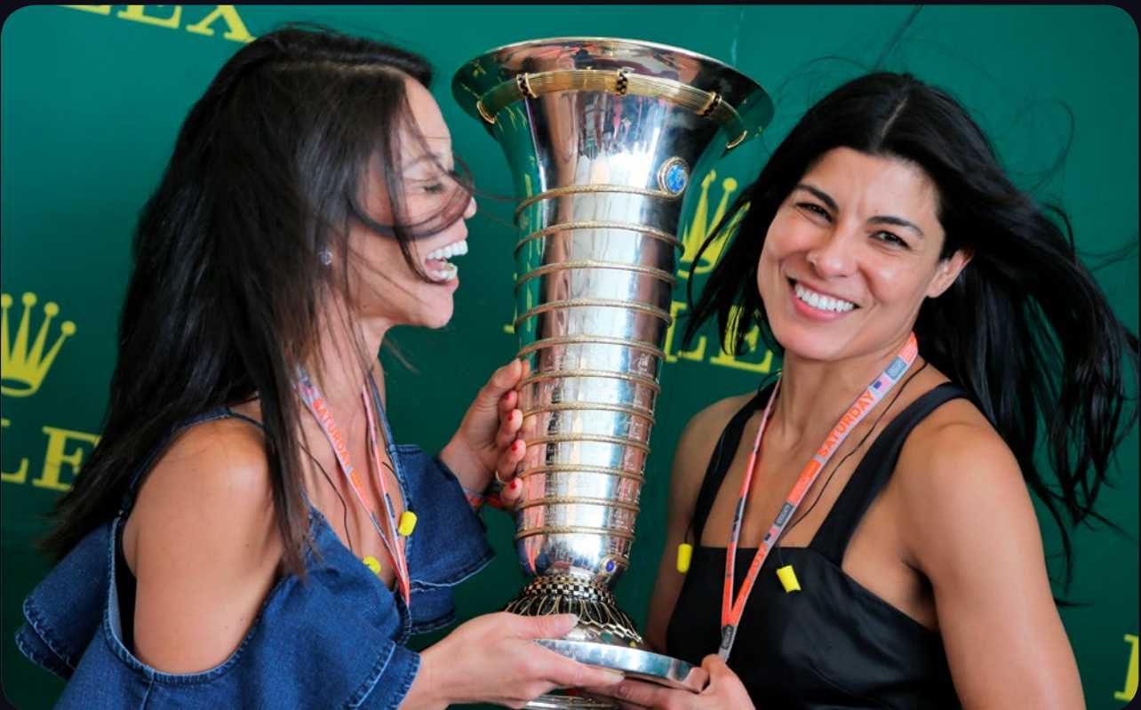
Lift the Championship Trophy