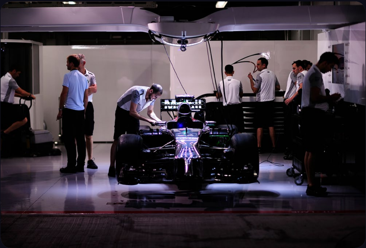
Exclusive access to the pit lane