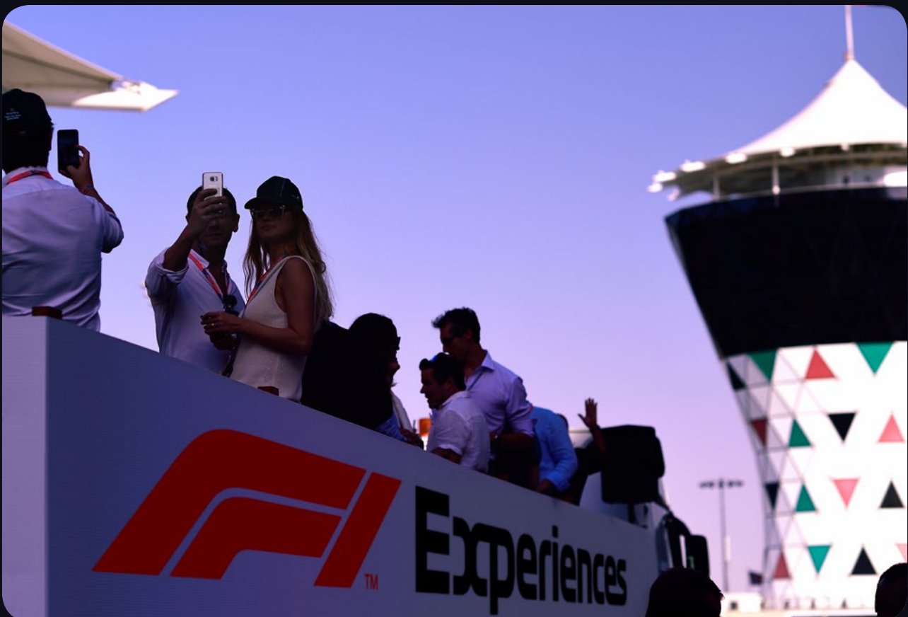
Guided lap on a drivers' parade truck