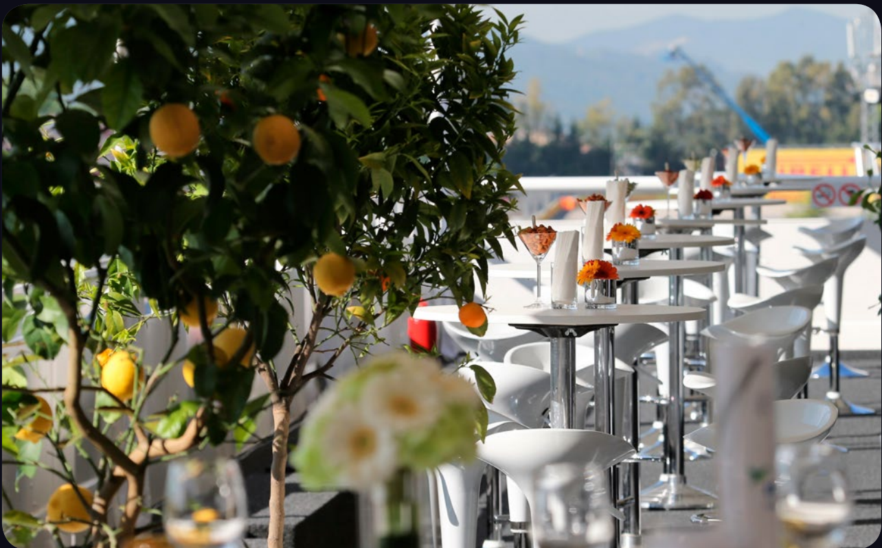
All-day refreshments and champagne bar