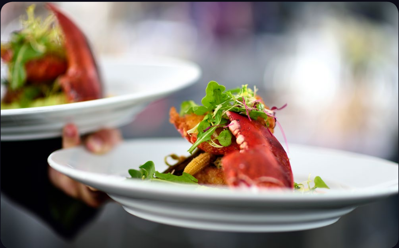
Exceptional cuisine and wines