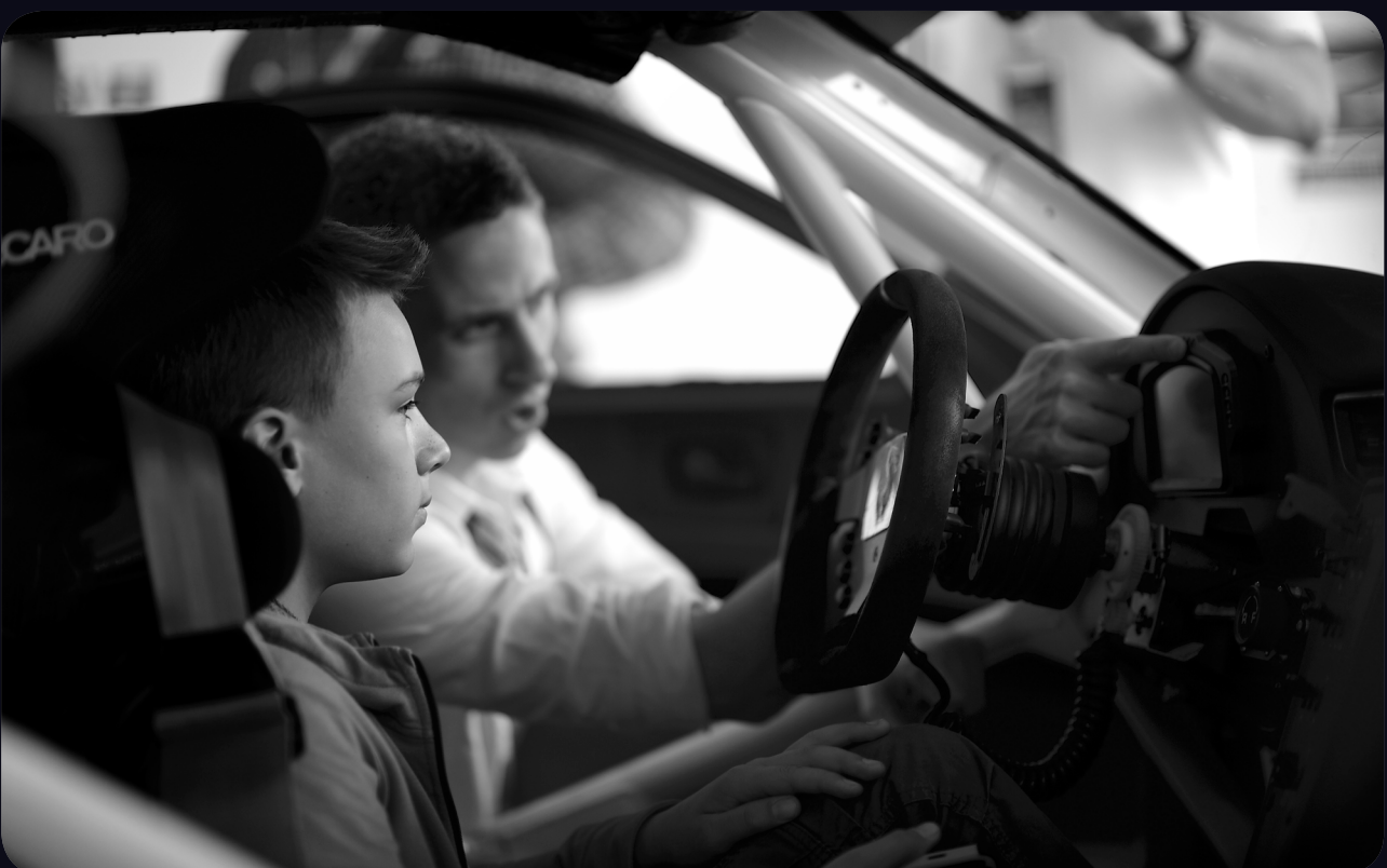
VIP access to the Support Race Paddock