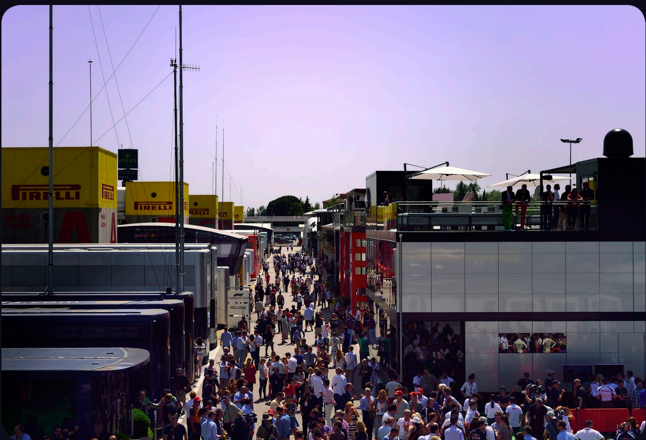
Opportunity to visit the F1 Paddock