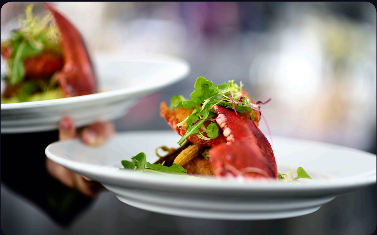
Exceptional cuisine and wines