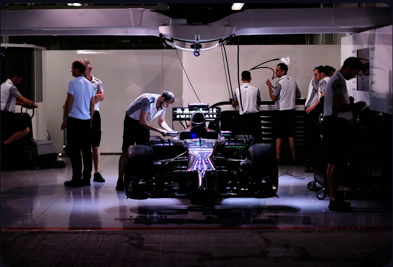
Exclusive access to the pit lane